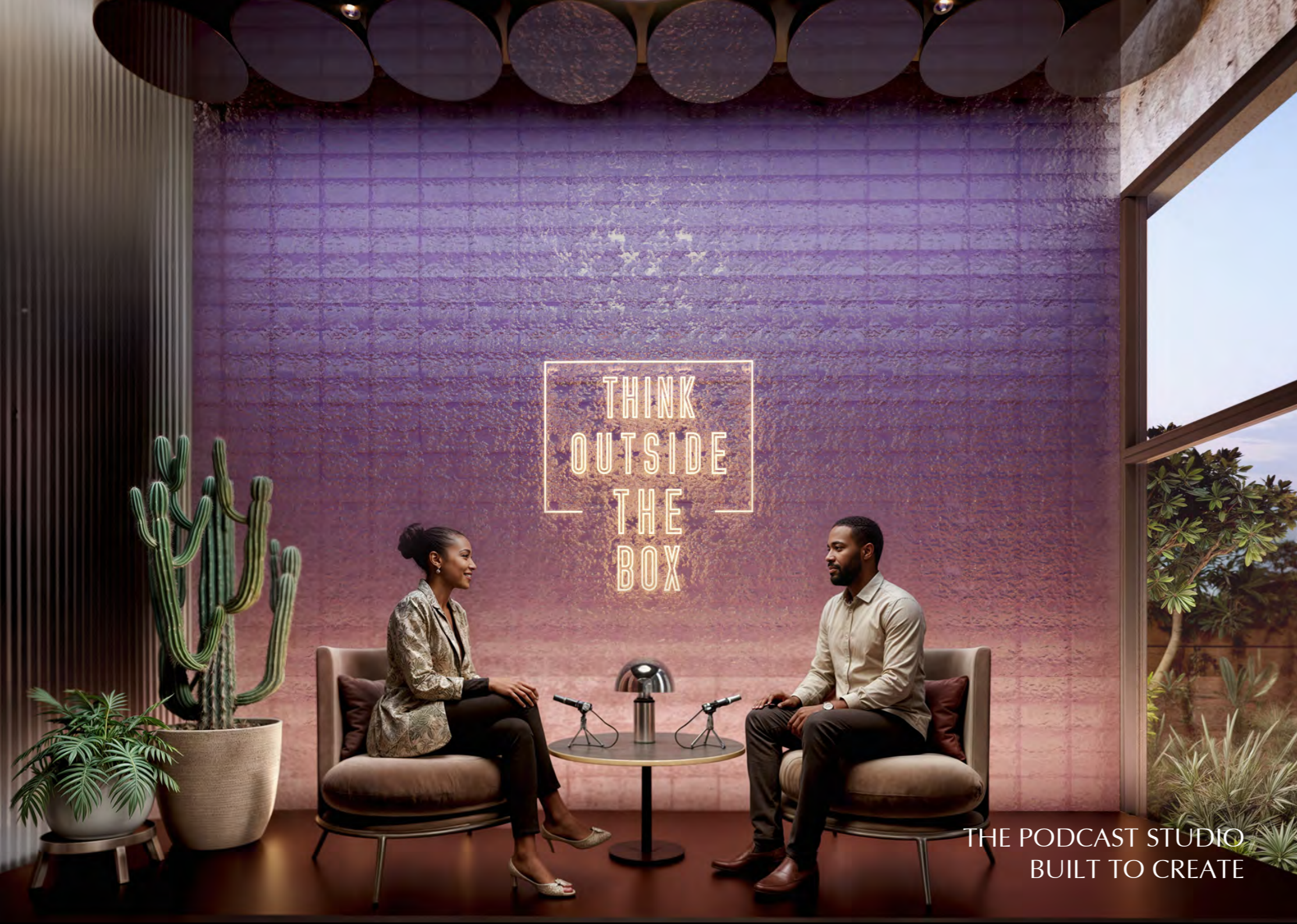
THE PODCAST STUDIO BUILT TO CREATE