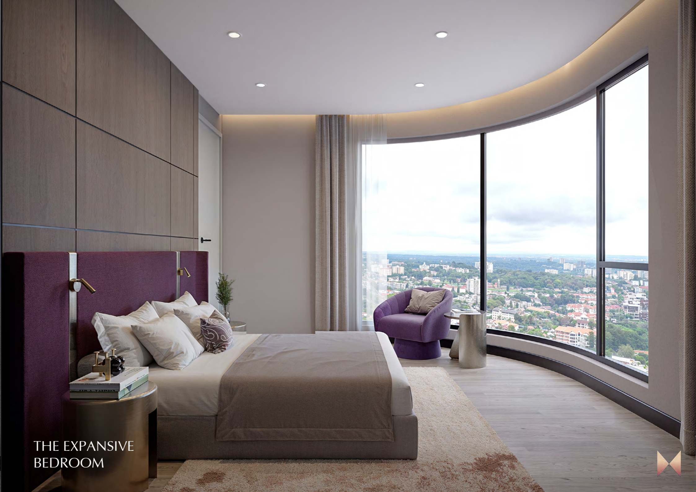
THE EXPANSIVE BEDROOM