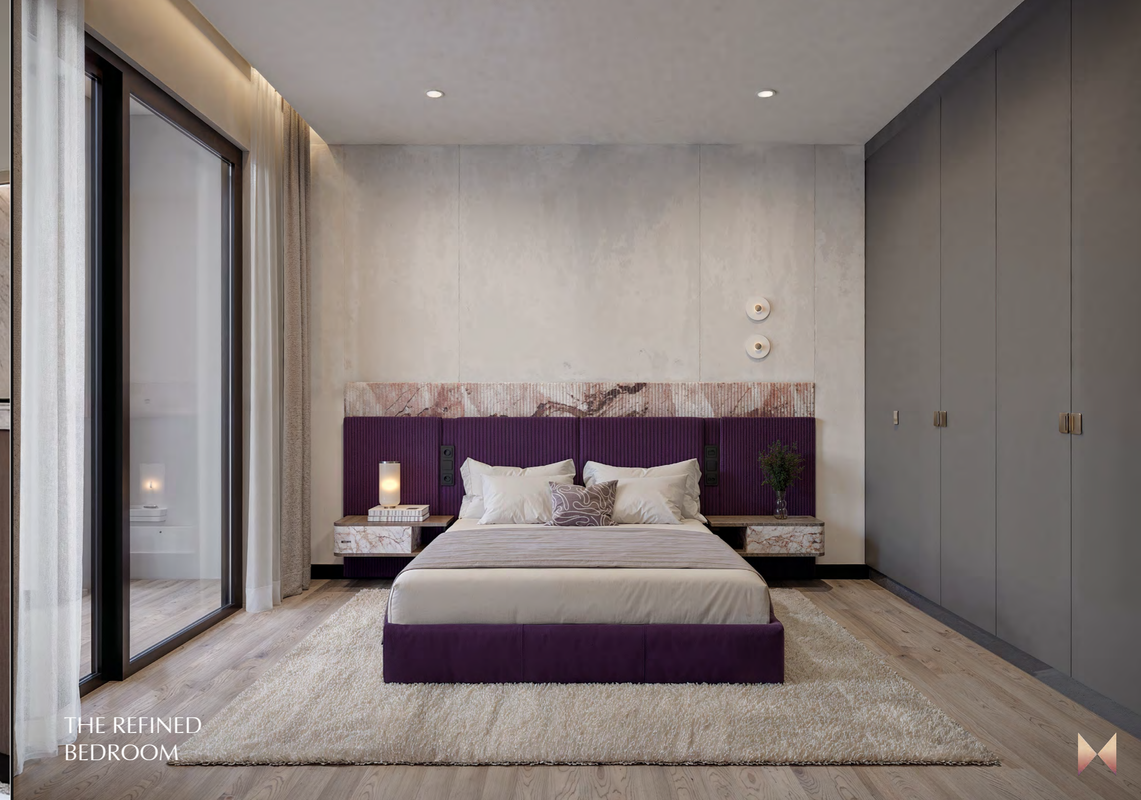
THE REFINED BEDROOM