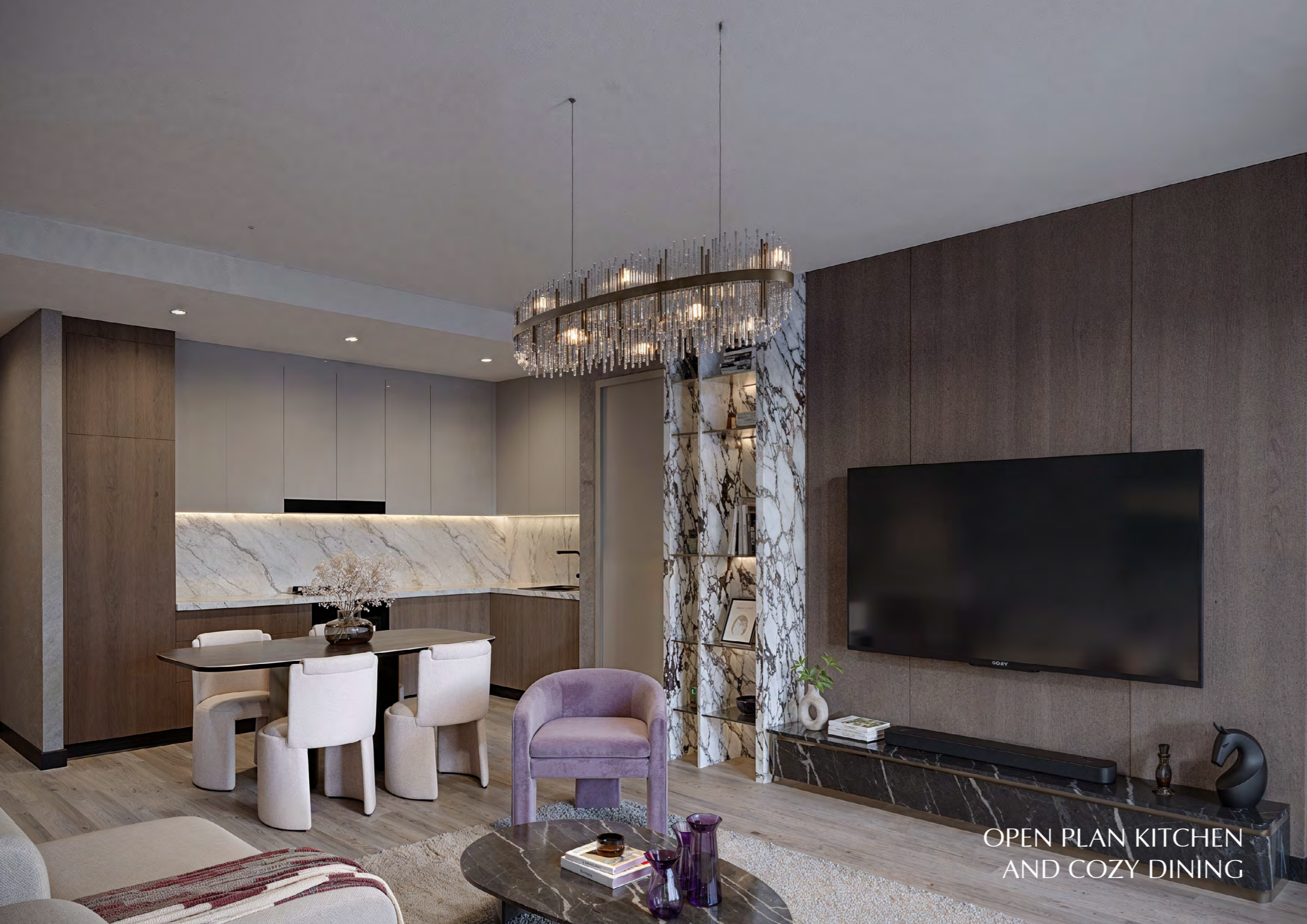
OPEN PLAN KITCHEN AND COZY DINING