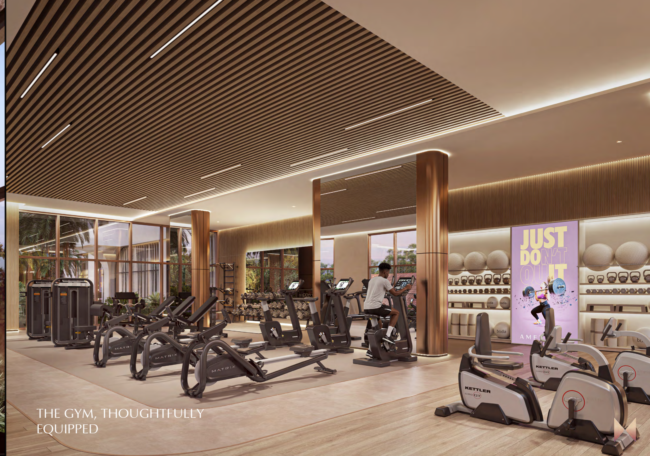
THE GYM, THOUGHTFULLY EQUIPPED