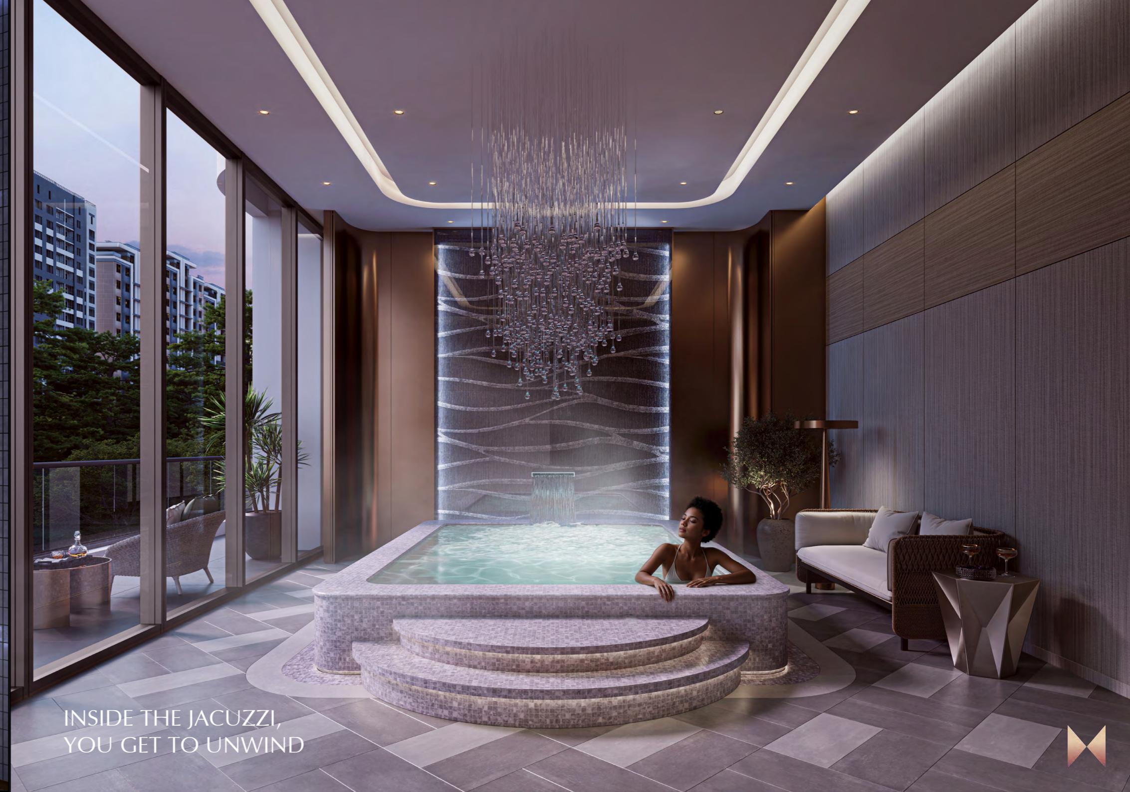
INSIDE THE JACUZZI, YOU GET TO UNWIND