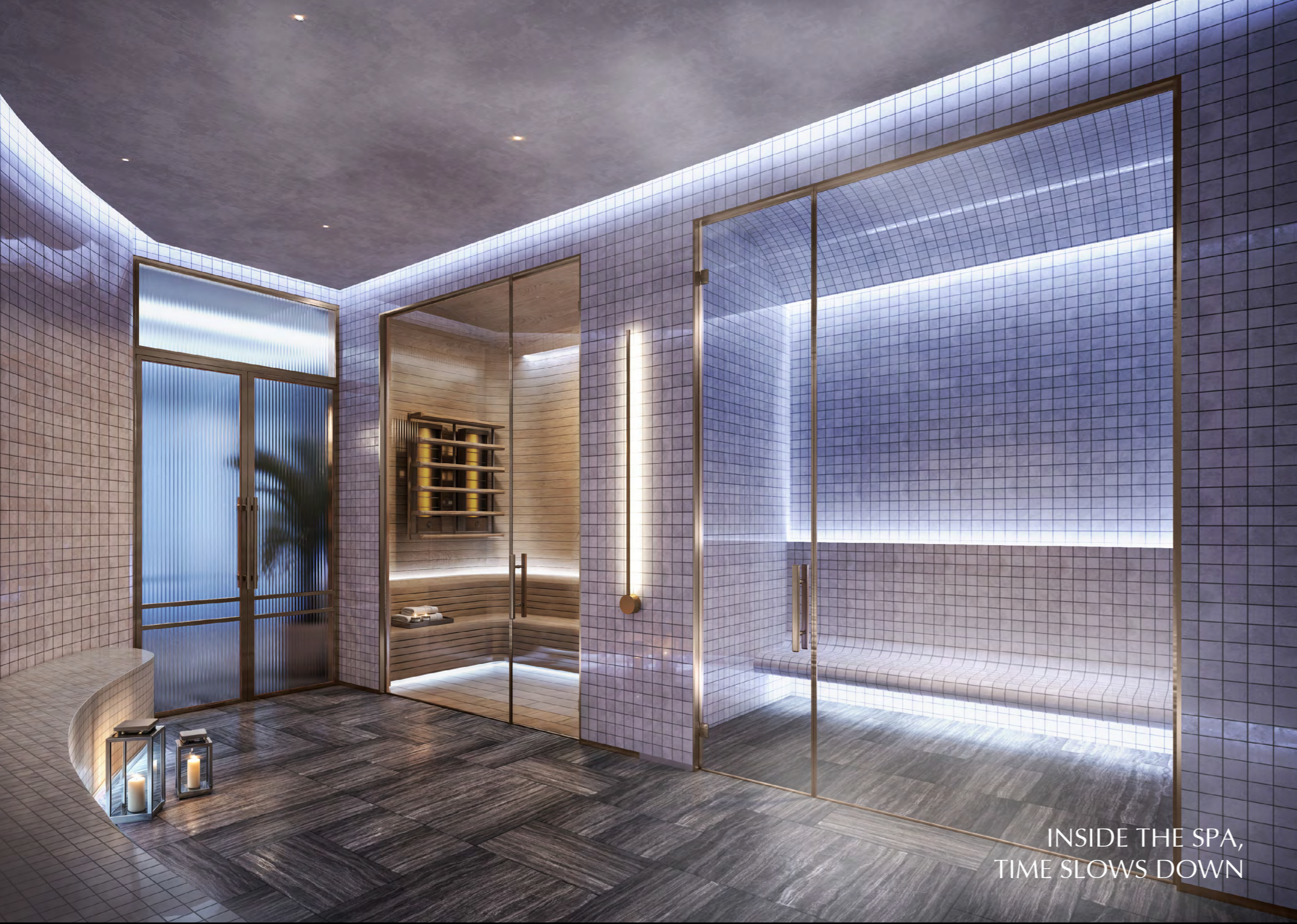
INSIDE THE SPA, TIME SLOWS DOWN