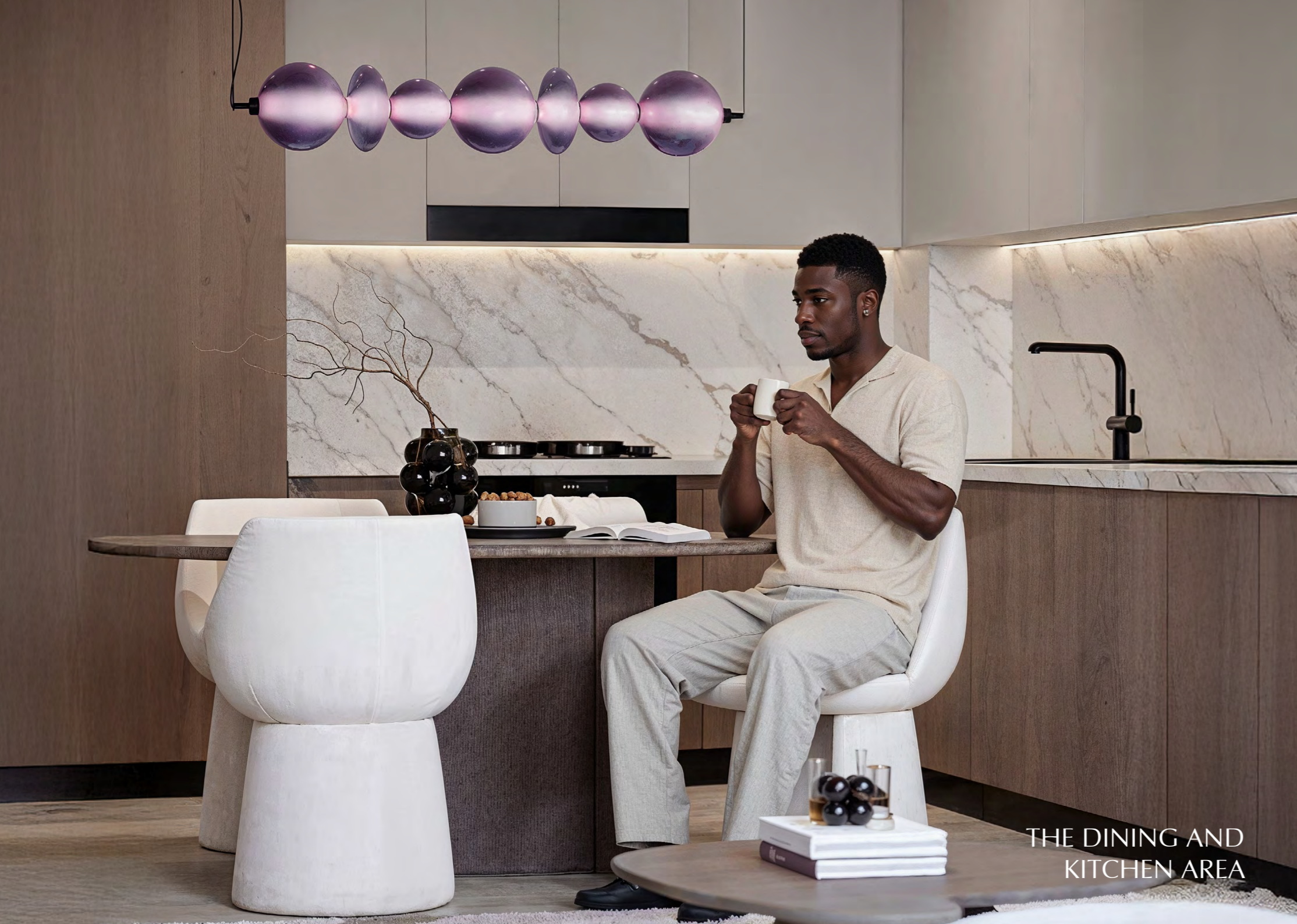
THE DINING AND KITCHEN AREA